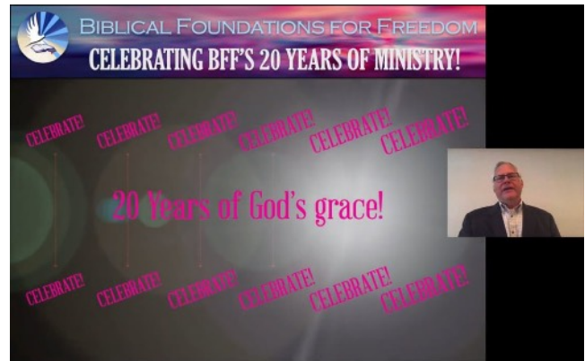
BFF 20 YEARS CELEBRATION

We were unable to host a BFF 20-year Celebration banquet but did produce a video that summarizes BFF's staggering progress through these two decades. Thank you for playing such a key role in this work through your prayers, advice, and giving. (Click above to view.)